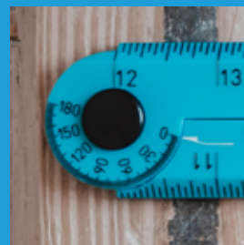
BONUS ANGLE FINDER FROM 0-180°