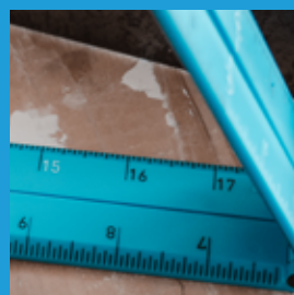
1/16" MARKED INCREMENTS FOR HIGH-ACCURACY MEASUREMENTS